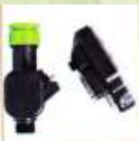
2. Easy Readable Screen Position